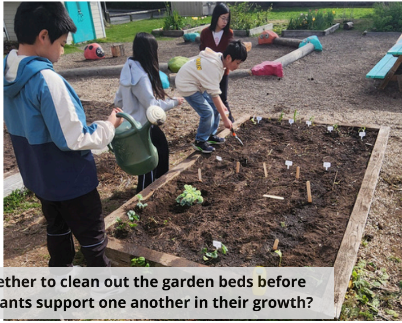
Planting has begun! Students worked together to clean out the garden beds before planting vegetables and flowers. How do plants support one another in their growth?