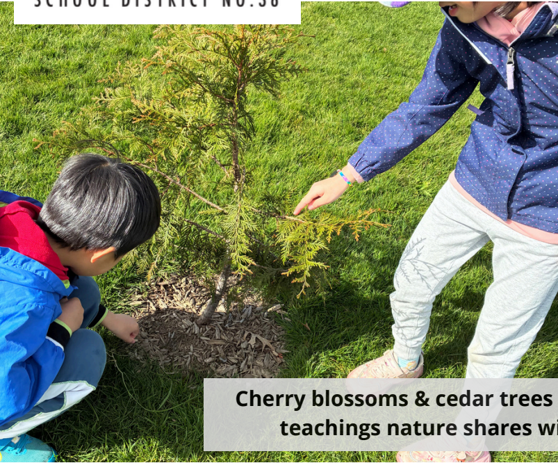
Cherry blossoms & cedar trees - the many teachings nature shares with us.