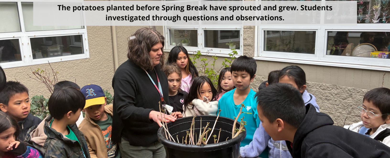
The potatoes planted before Spring Break have sprouted and grew. Students investigated through questions and observations.