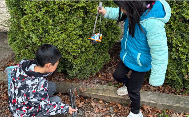
A sense of belonging can be seen in many ways - one of the ways is through our care for place and Land. Primary students took initiative to start a "Clean Up Club" at recess and lunch. Thank you for taking care of our school!