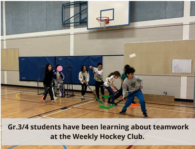
Gr. 3/4 students have been learning about teamwork at the Weekly Hockey Club.