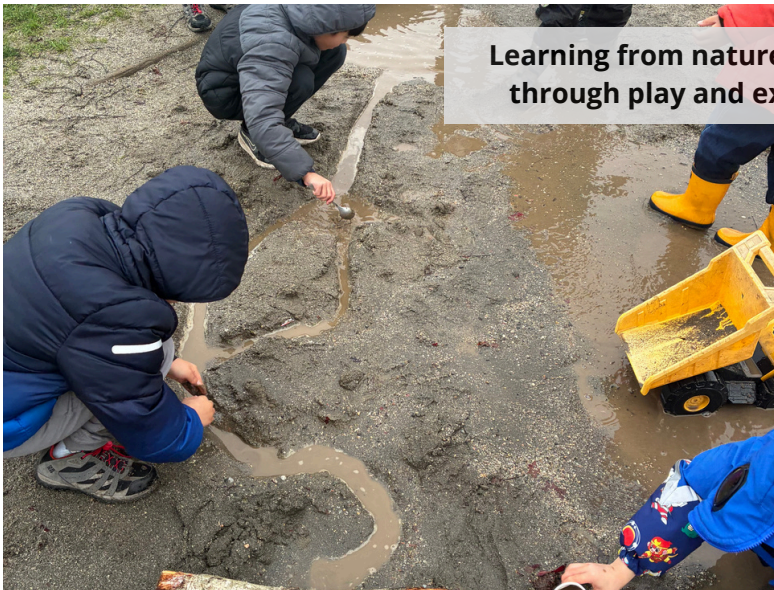
Learning from nature: investigating river systems through play and exploring patterns in nature.