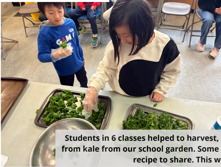
Students in 6 classes helped to harvest, prepare, bake, and distribute kale chips from kale from our school garden. Some students documented and wrote out the recipe to share. This was truly a team effort!