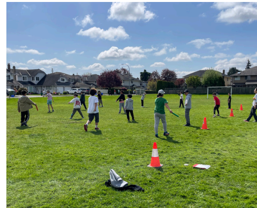
Track Attack has begun! Students in Gr. 4 - 7 are trying out different track and field events over the next 2 weeks to get ready for the District Track Meet on May 26 th .