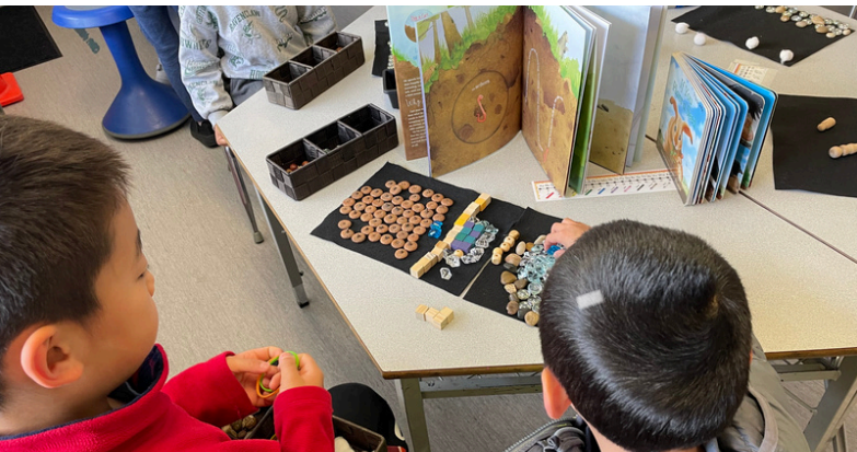
Div 7 students using different materials to explore the concept of community: What is a community? Why do we need it?