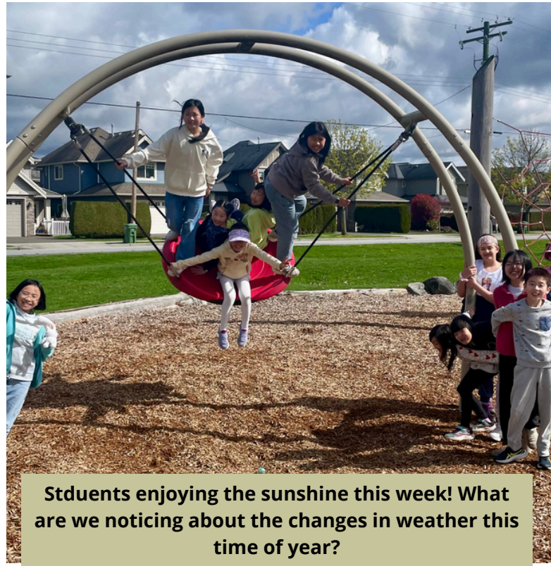
Students enjoying the sunshine this week! What are we noticing about the changes in weather this time of year?