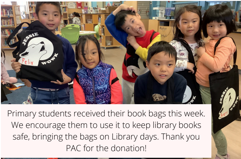
Primary students received their book bags this week. We encourage them to use it to keep library books safe, bringing the bags on Library days. Thank you PAC for the donation!