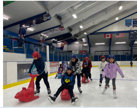
Div. 3, 5, 6, 7 went on a skating field trip. Whether this was their first time on the ice or if skating comes naturally, students supported each other through their shared experience.