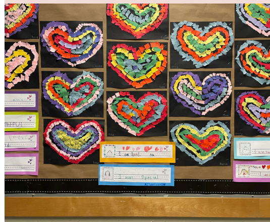
Div 9 students sharing their gifts through art & writing.