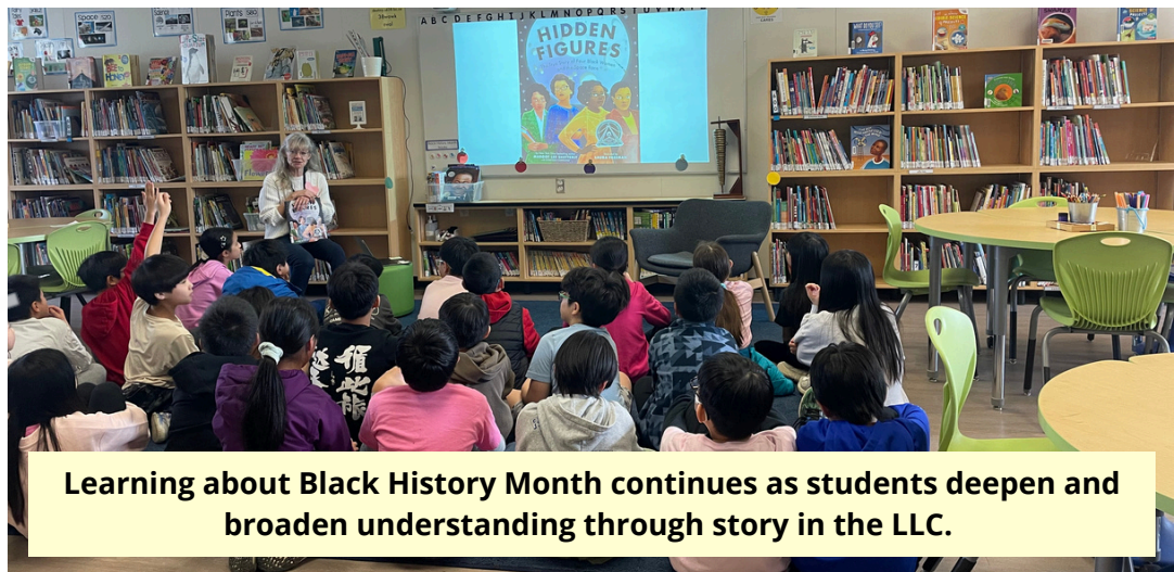
Learning about Black History Month continues as students deepen and broaden understanding through story in the LLC.