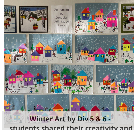
Winter Art by Div 5 & 6 - students shared their creativity and unique styles.