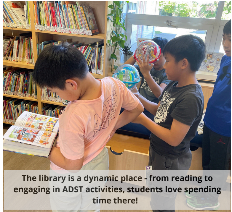
The library is a dynamic place - from reading to engaging in ADST activities, students love spending time there!