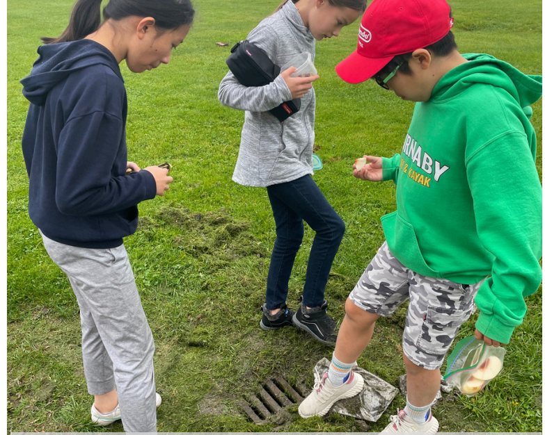
Caring for Place: uncovering the storm drains to prevent flooding.