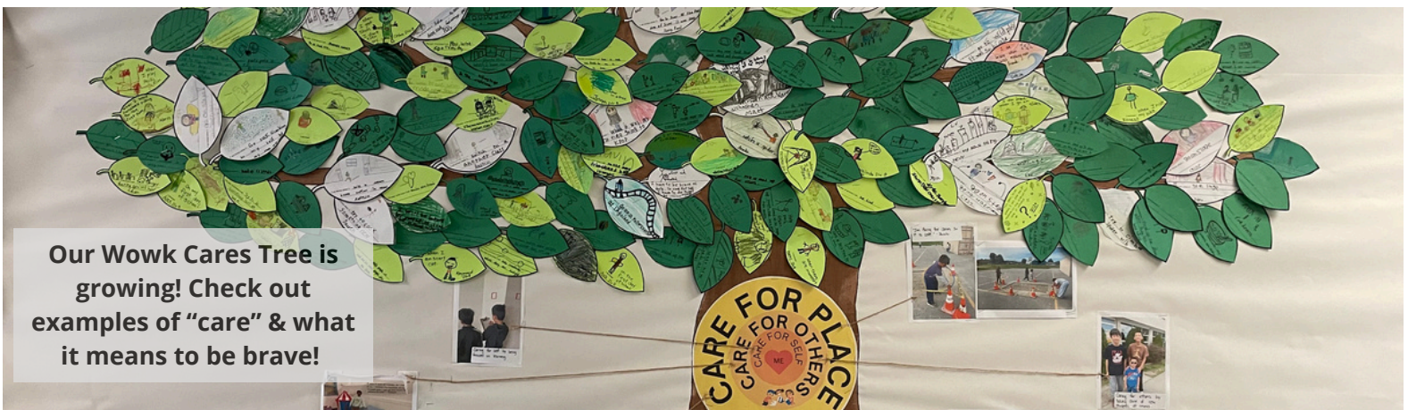
Our Wowk Cares Tree is growing! Check out examples of "care" & what it means to be brave!