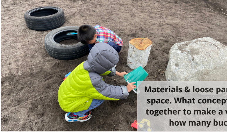
Materials & loose parts have been added to our outdoor space. What concepts are uncovered? "We are working together to make a volcano." "We are measuring to see how many buckets we need to fill the tire."