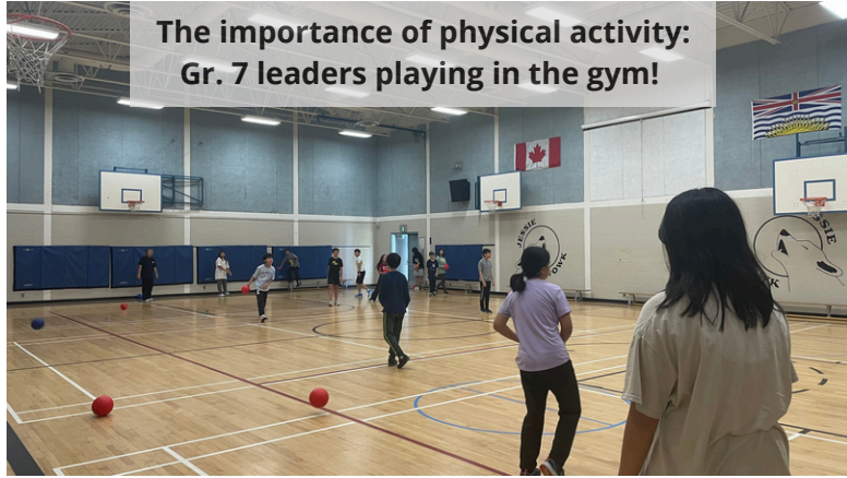
The importance of physical activity: Gr. 7 leaders playing in the gym!