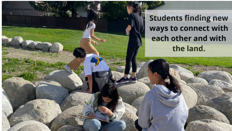
Students finding new ways to connect with each other and with the land.