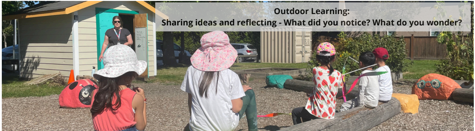
Outdoor Learning: Sharing ideas and reflecting - What did you notice? What do you wonder?