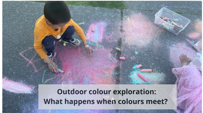
Outdoor colour exploration: What happens when colours meet?