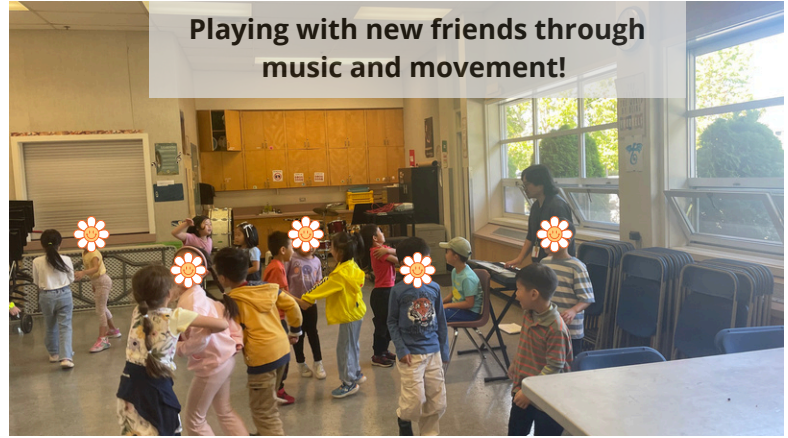
Playing with new friends through music and movement!