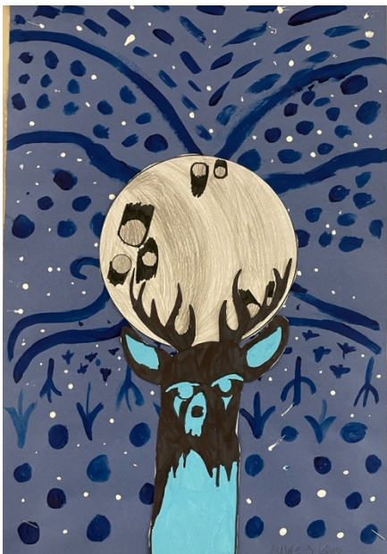
Indigenous Moons By Division 3