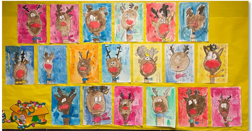
Rudolphs By Division 9