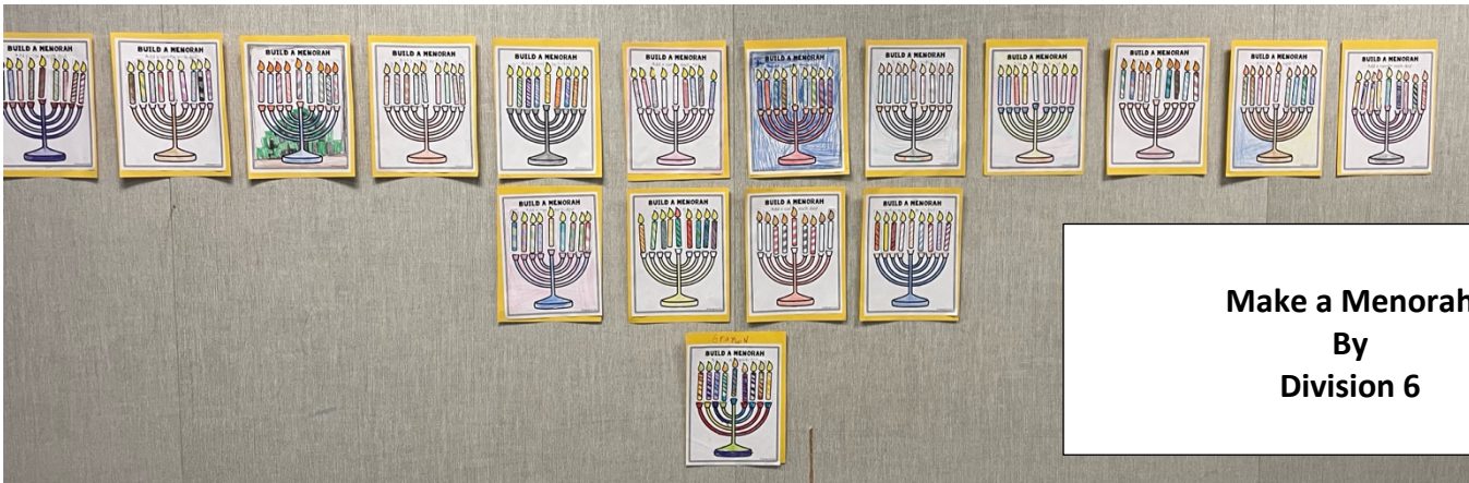
Make a Menorah By Division 6