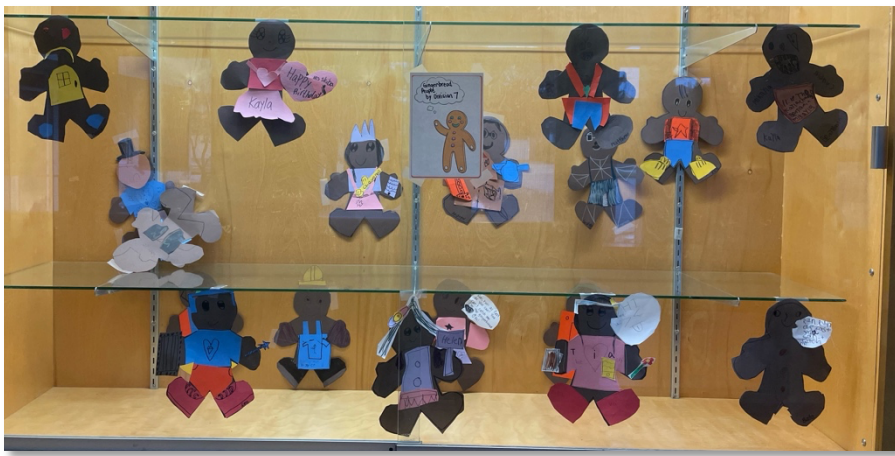
Gingerbread Men By Division 7