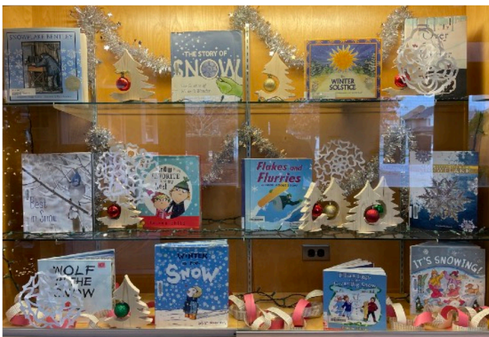
School Display: Literature of The Season and Holiday Ornaments by Division 1 and 2