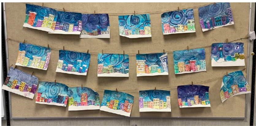
Winter City Scenes by Division 5