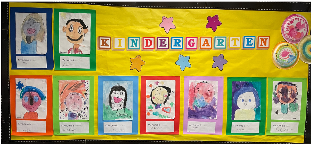
Self Portraits by Division 9