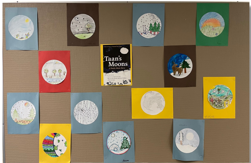
Moon Sketches (Inspired from the story Taan's Moons) By Division 3